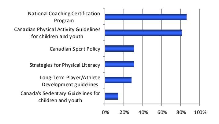
FIGURE 1 Awareness of physical activity and sport resources

Opportunities for Physical Activity at School Survey, 2015, CFLRI